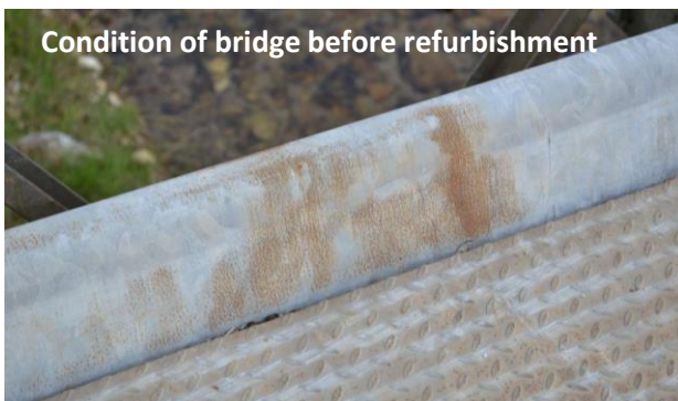
Condition of bridge before refurbishment

In February 2014, the TOTAL Bridge USB 100B located in Myanmar, was refurbished with ZINGA (1,606 m 2 ). The hot-dipped bridge was in bad condition with several places of corrosion. (tropical environment: high T° and humidity)