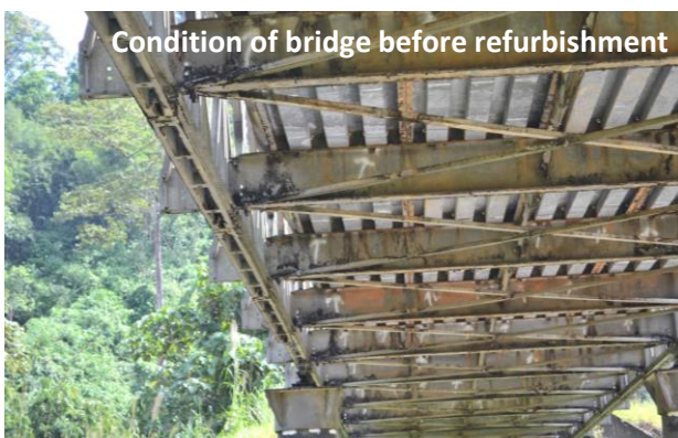
Condition of bridge before refurbishment