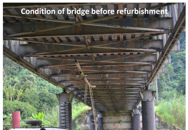
Condition of bridge before refurbishment

In February 2014, the TOTAL Bridge USB 100B located in Myanmar, was refurbished with ZINGA (1,606 m 2 ). The hot-dipped bridge was in bad condition with several places of corrosion. (tropical environment: high T° and humidity)