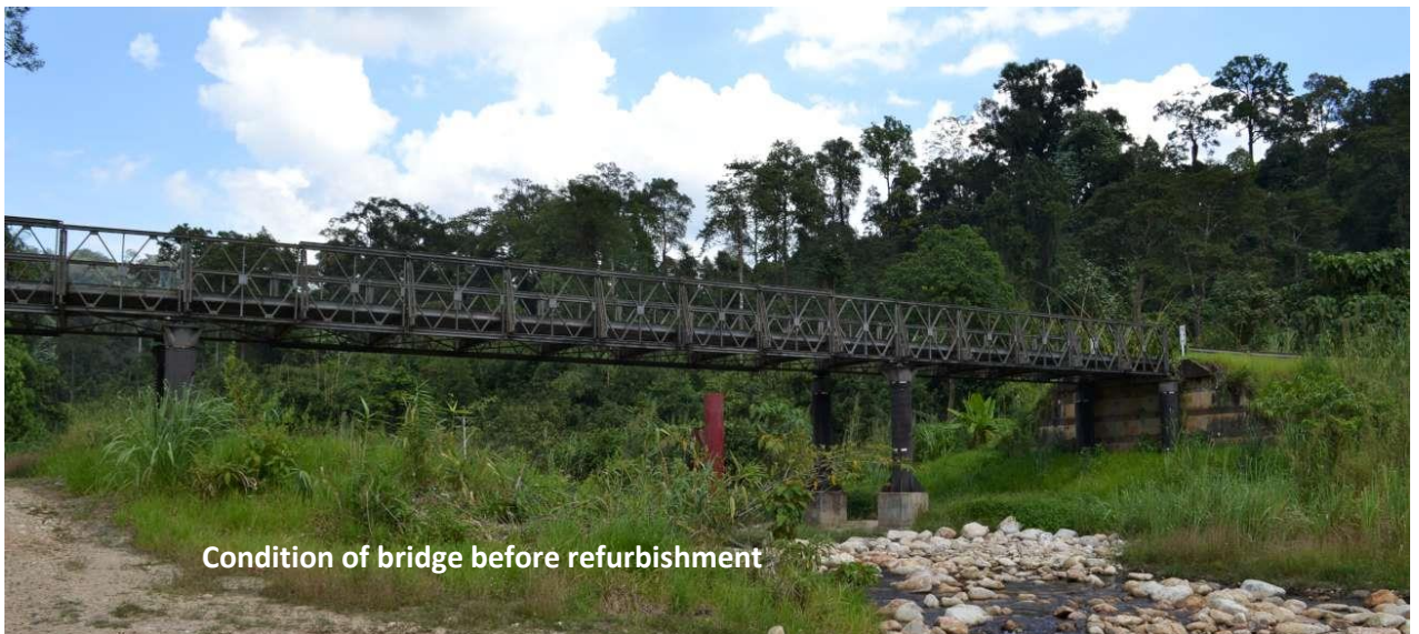
Condition of bridge before refurbishment

TOTAL S.A. is a French multinational integrated Oil and Gas company and one of the six "Supermajor" oil companies in the world. Its businesses cover the entire Oil and Gas chain, from crude oil and natural gas exploration and production to power generation, transportation, refining, petroleum product marketing, and international crude oil and product trading. TOTAL is also a large-scale chemicals manufacturer. The company has its head office in the TOTAL Tower in La Défense district, west of Paris. The company is listed Euro Stoxx 50 stock market index.