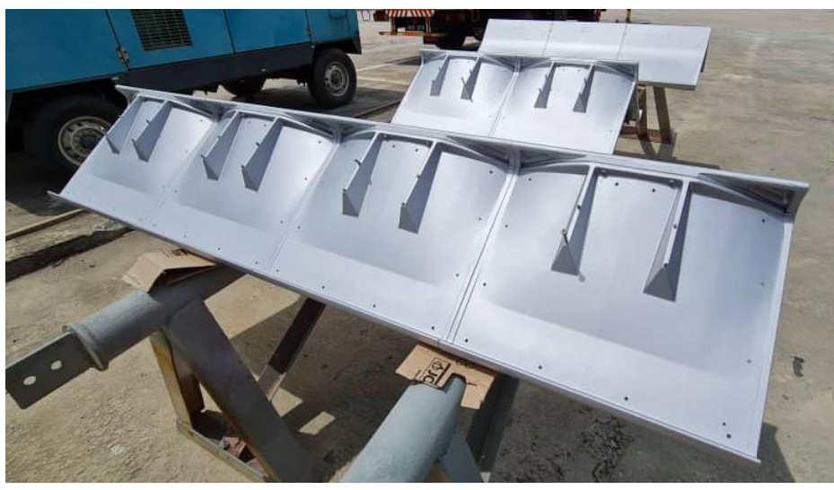
After application of the ALU ZM layer