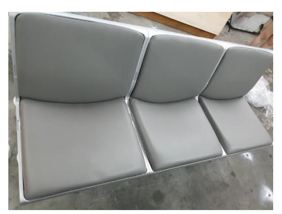
Ready for delivery to KLIA