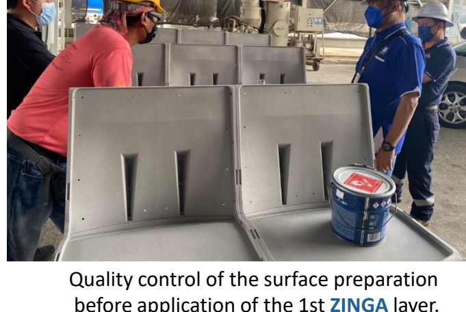
before application of the 1st ZINGA layer.