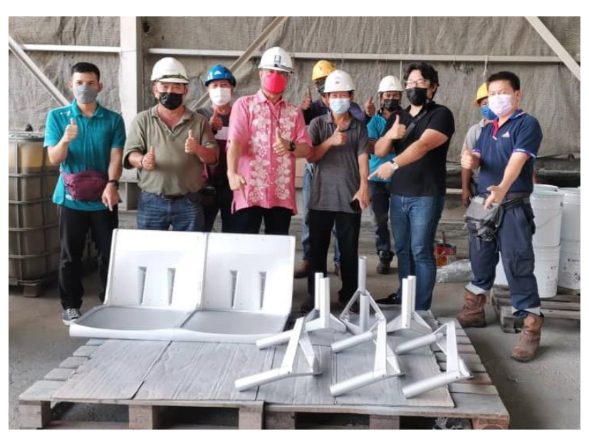
(above) The ZINGAMETALL Johor Team