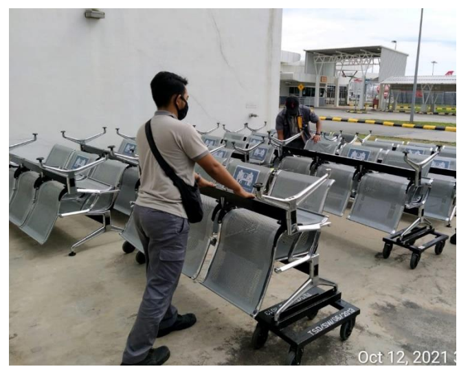
Picking up chairs at the KLIA Terminal

This contract includes, among other things, the refurbishment of all the chairs at Terminals 1 & 2 at Kuala Lumpur International Airport (KLIA).