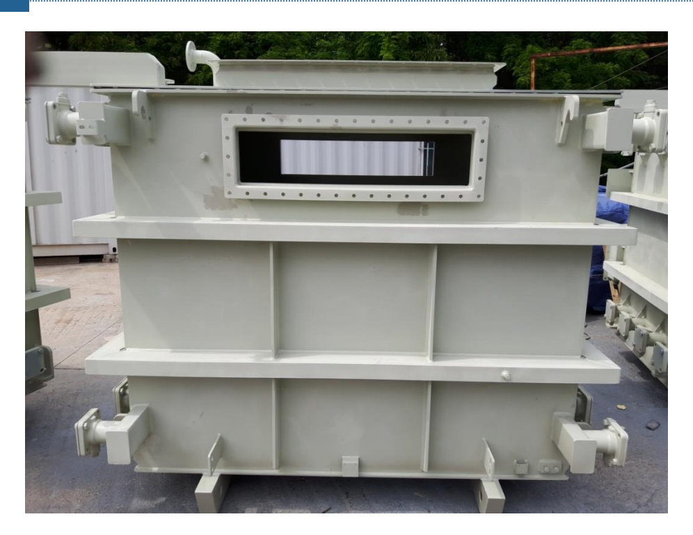
Transformer body: Topcoat applied