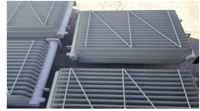
Transformer components (control box cases, radiators): Topcoat applied