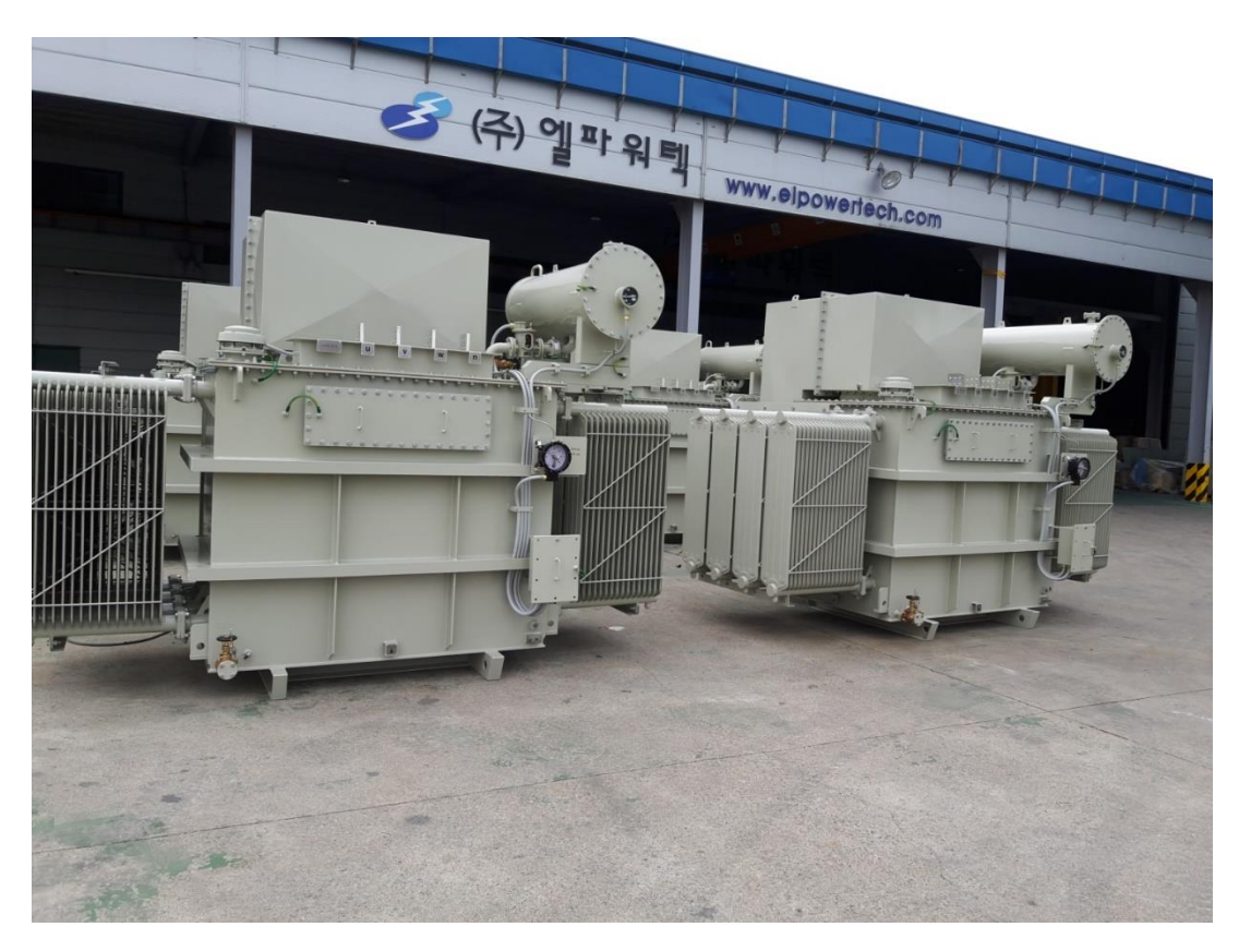
2500 & 3000 KVA Transformers – ready for delivery