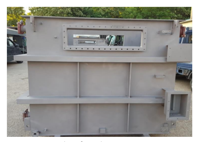
Body: After Blasting

The customer, SOLAR FRONTIER (Minato, Tokio, Japan) had already a good experience with ZINGA in 2014, when ZINGA was coated on 10 sets of 500 KVA pad-type transformers, and he was satisfied with the ZINGA product. After grit blasting (alumina grit), the transformers were coated with ZINGA at 80 microns followed by mist-coat and full-coat urethane top-coat (60 microns, domestic product from Korea Chemical Company, KCC).