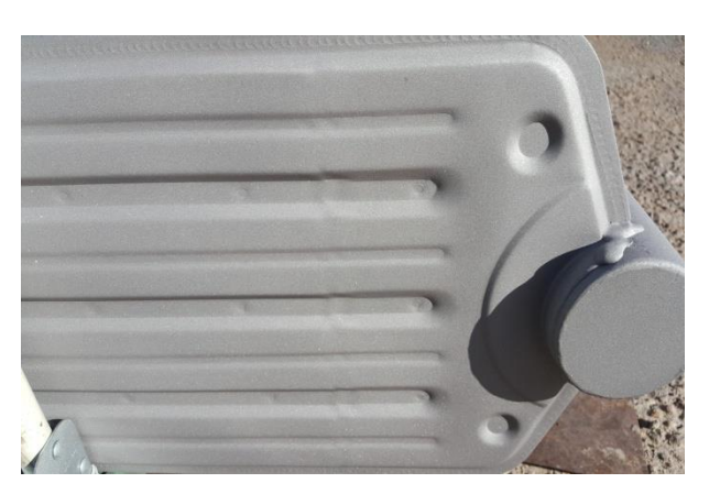
Detail of blasted surface