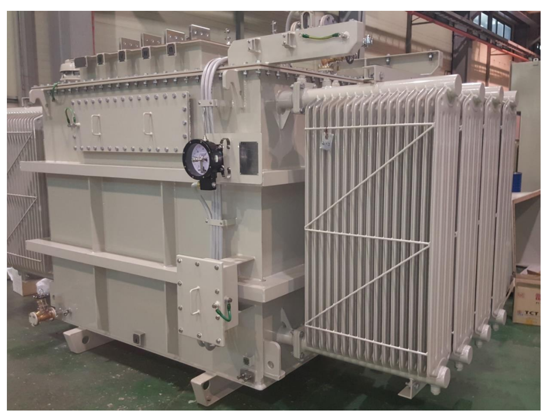
3000 KVA Transformer – ready for delivery