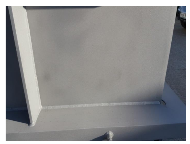
Detail of blasted surface