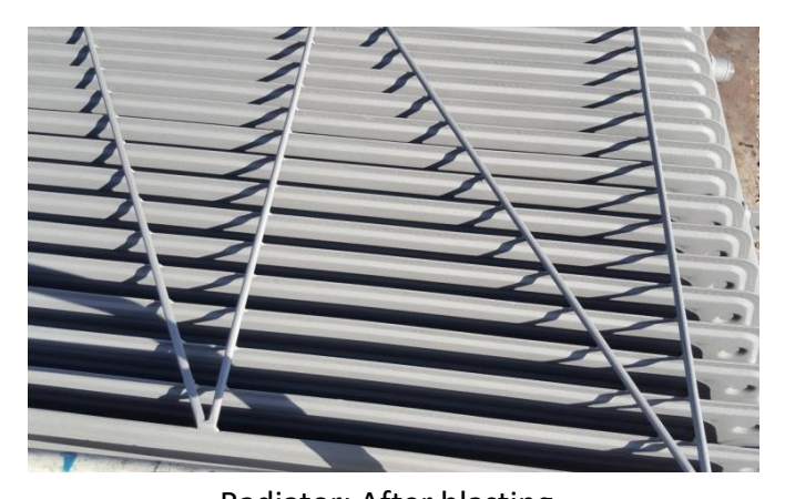
Radiator: After blasting