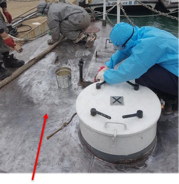
Application of ZINGA