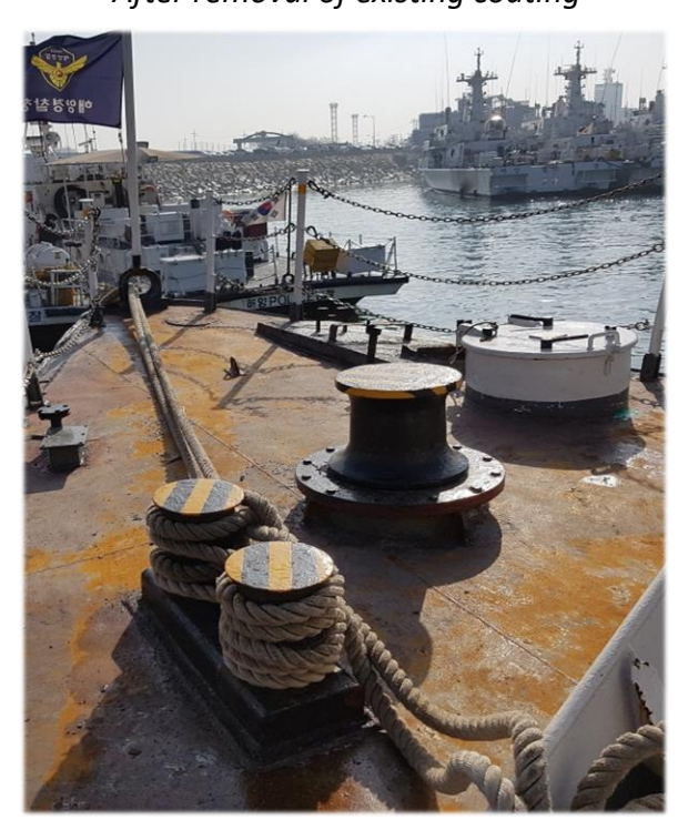
After removal of existing coating

Surface preparation: St 3 ZINGA 1 \times 60 \mu m DFT Vinyl Paint FS-26081