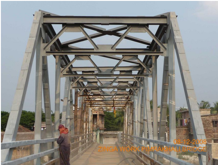
Aluminium PU topcoat

This fact was quite evident from the condition of the bridge which is just 8 years old. Some portions of the bridge were totally distorted due to corrosion and had to be replaced before the coating application could be started in 2008.