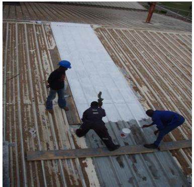
Epoxy primer application