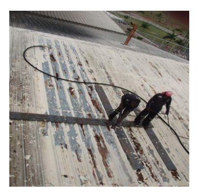
High pressure washing