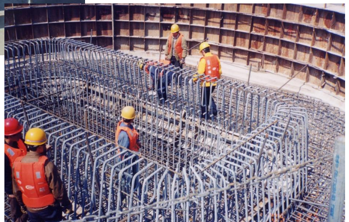
Rebars protected with ZINGA