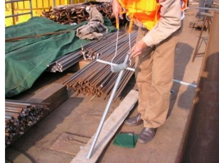
Brush application of ZINGA