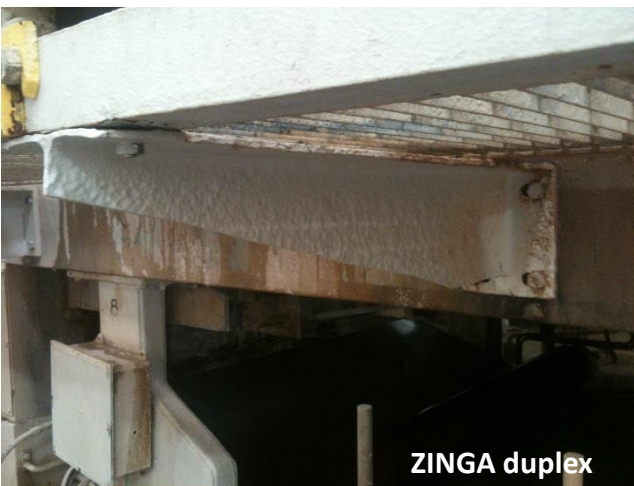
After 24 months, the ZINGA system showed no signs of corrosion. All supports not treated with ZINGA received the ZINGA system after 18 months

The conclusion of maintenance manager was that after 18 months ZINGA system had at least tripled expected time period between maintenances.