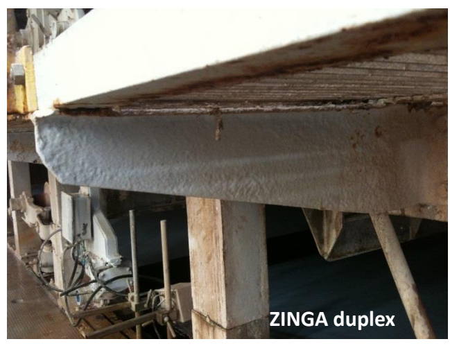
12 months after application