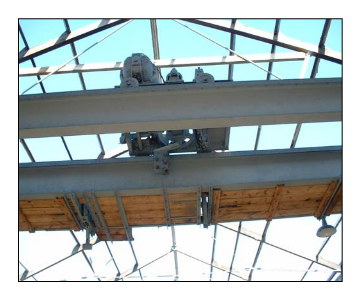
Above: The original overhead travelling crane was also zinganised in order to preserve to whole structure to Victorian standards