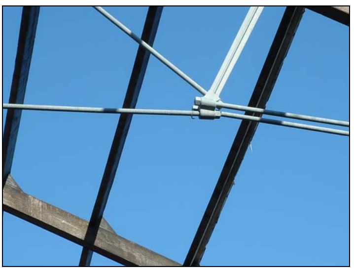
Above: The roof beams are all made from timber, and the steel tie-rods were zinganised.

A new roof is being made for the completed building