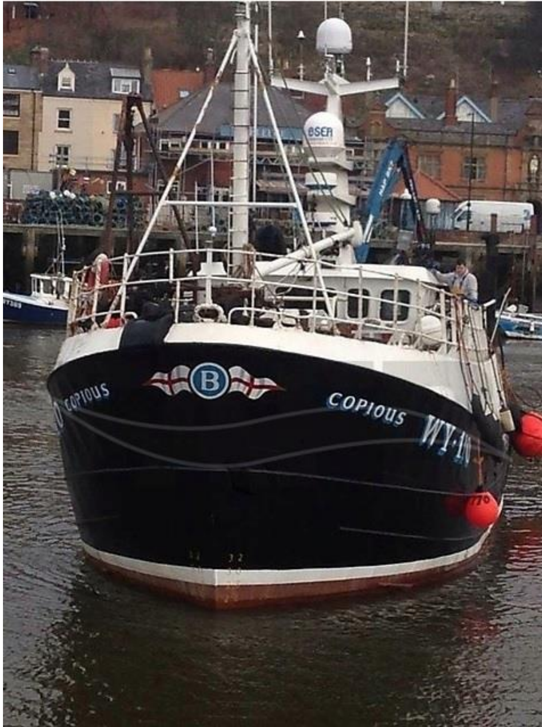
MV Copious photographed in Whitby harbour during December 2013