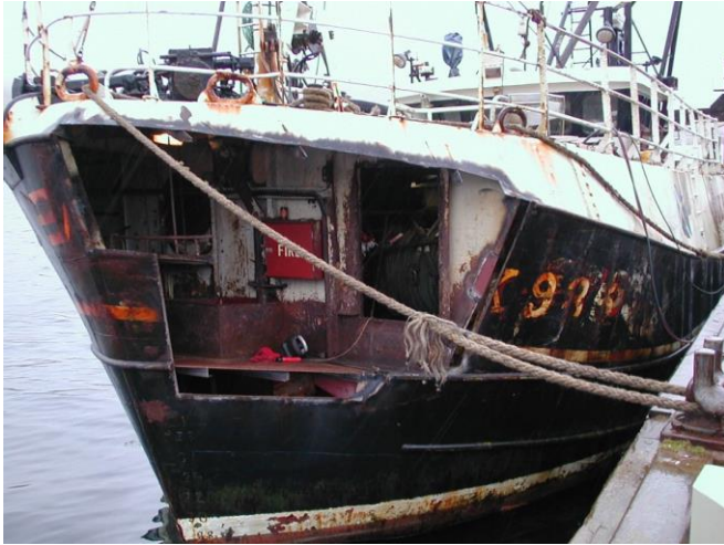
Bows cut open for new plating to be welded in

She came into Lerwick harbour in 2001 to have her port bow re-plated following damage. The owners were convinced to coat her with Zinga, and said they would coat the Copious but not her twin-sister. It cost £4600 (approx. €5700) to blast and coat her with Zinga + the paint top-coats. After 10 years they had spent nothing on hull maintenance. Her sister ship had £14,000 spent on her during this time, including two propeller changes.