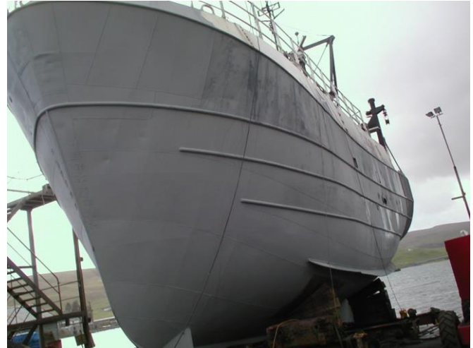
Zinga application is shown from the bows. Note no anodes.