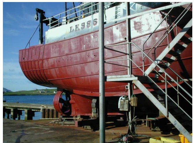
Coated with Jotun Tie-coat 100 epoxy primer