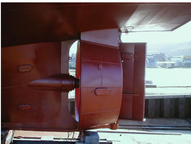
Views of the coated thruster-tube