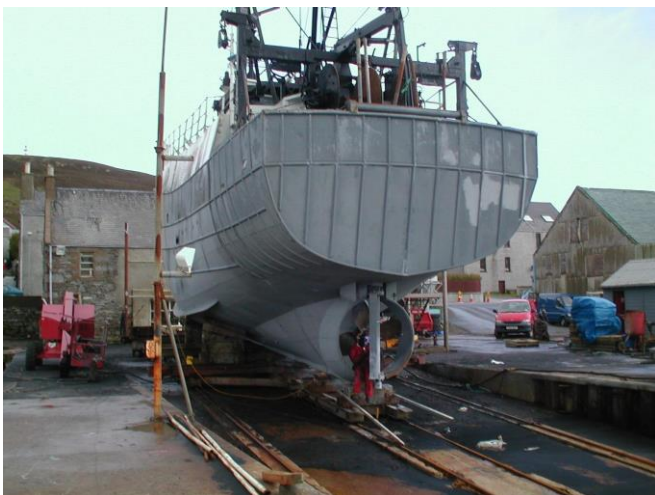
Zingatised hull viewed from the stern